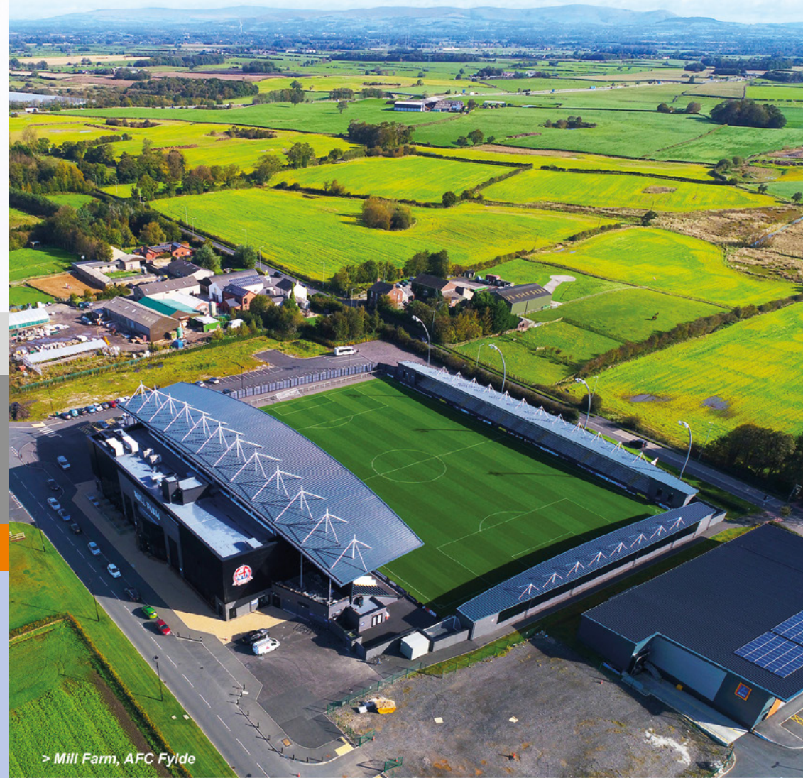
> Mill Farm, AFC Fylde

architecture • project management • structural engineering • interior design building surveying • m&e design • quantity surveying • cdm consultancy